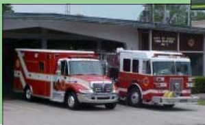
Your Fire Division has 42 uniformed personnel and the Chief and Deputy Chief. They respond to approximately 4,700 calls per year.