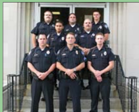
Your Police Division has 45 uniformed personnel, 5 civilian staff, and 2 part-time personnel for parking enforcement; the Communications Division has 20 dispatchers and 2 administrators. They respond to approximately 22,000 calls per year.