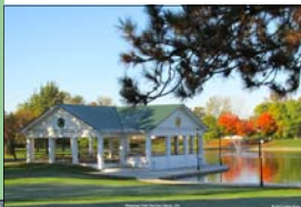
One Public Service Maintenance Worker is assigned to maintain 14 parks in the City of Xenia.